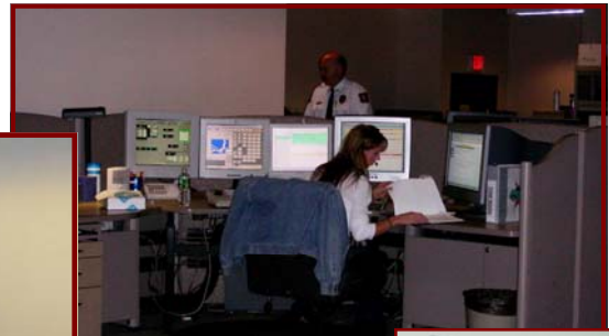
Edison 9-1-1 before