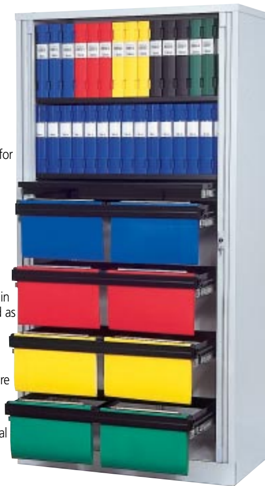
78" high cabinet shown with 2 Stationary Shelves, 1 Roll-out Shelf and 4 Roll-out File Frames.

Cabinets are shipped flat, ready to assemble.