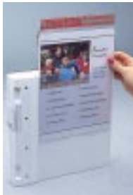
Add our innovative Insertable for easy insertion of your cover sheets.

The Access BestBuilt Presentation Binder has a see-through pocket on the front, allowing you to slip in your own printed sheet. Inside the cover are pockets to hold business cards and extra sheets of information.