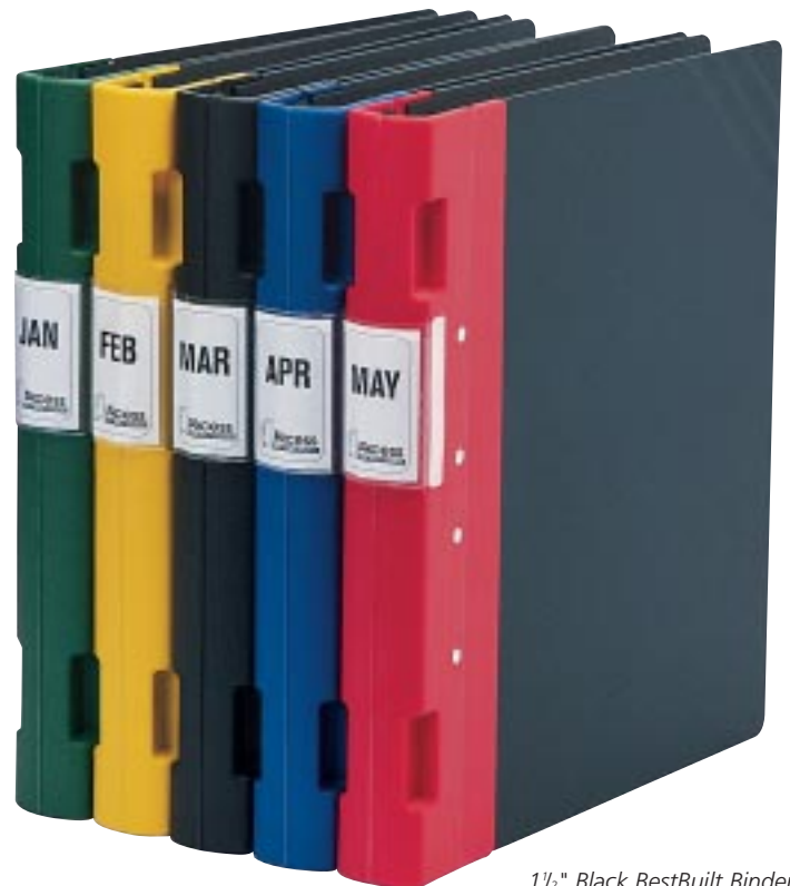
1 1/2" Black BestBuilt Binders.

Slimline Binders. The slimline binders have all the same features as our regular binders. Binders are 11 1/2" h x 1 1/2" w x 11 1/2" d and hold up to 200 sheets of paper. These binders are perfect for smaller reports or projects.