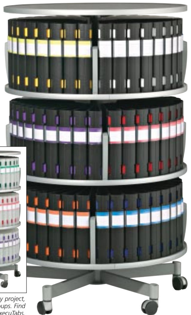
Code binders by project, accounts or workgroups. Find items easier with ExecuTabs.

We're so confident in the performance of our BestBuilt Binders that if for any reason there is a defect in the material or function of your binders, we will replace them free of charge.