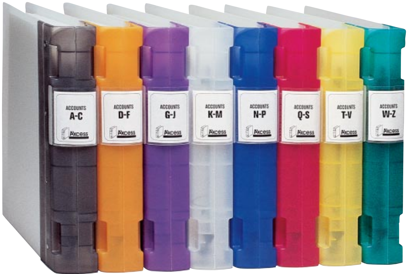
2 1/4" Frost BestBuilt Binders.