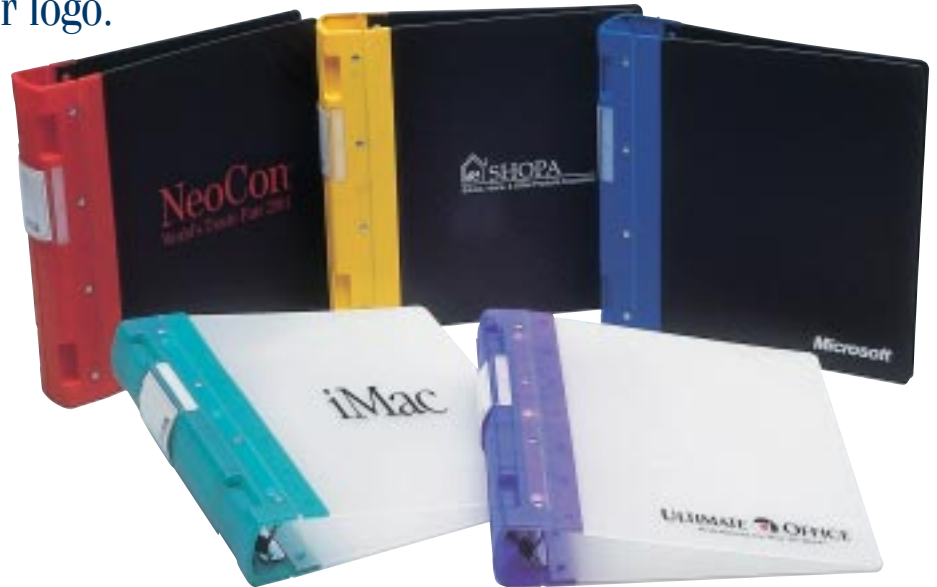
Custom screen print logos on your Binders for added impact. Create stunning Binders for product launches, trade show booths, employee orientation kits and much more. Artwork can be printed on either frost or black covers.

In addition, 4-color offset printing is available on special laminated front and back covers with images up to 9 x 12 inches (minimum order is 500 units). Please call for additional information on printing methods, artwork, pricing and delivery.