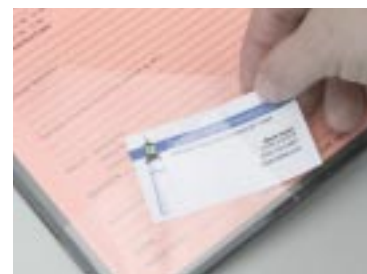
Front and inside pockets let you customize your binder for specific presentations or customers.