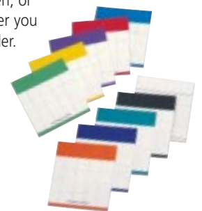
Labels provide instant identification of binders while on shelves.